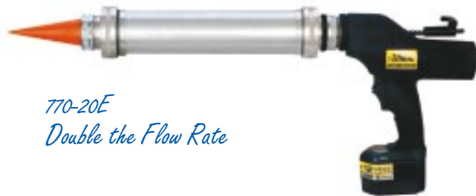
770-20E Double the Flow Rate

Model 770-20E — Provides double the flow of our 2" bulk models •Similar in volume to our DL-59-T13E, except it's shorter allowing it to fit into more confined areas •Supplied with Albion's disposable orange plastic cones •Barrel size 2 5/8" dia. x 12" long •Recommended for joints larger than 5/8" wide