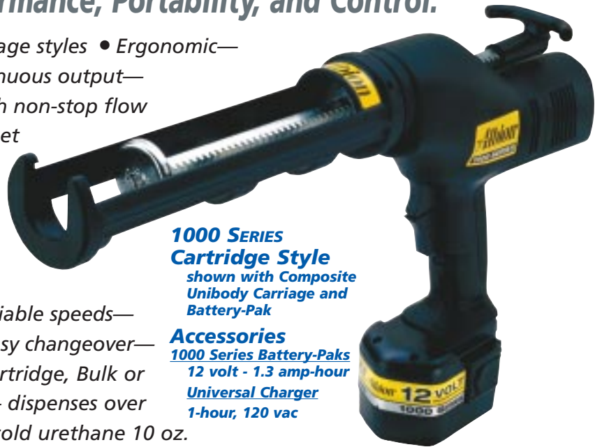
1000 SERIES Cartridge Style shown with Composite Unibody Carriage and Battery-Pak

Accessories 1000 Series Battery-Paks 12 volt - 1.3 amp-hour Universal Charger 1-hour, 120 vac