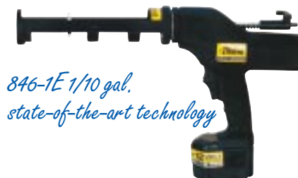
846-1E 1/10 gal. state-of-the-art technology