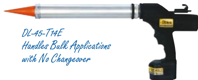
DL-45-T14E Handles Bulk Applications with No Changeover

Model DL-45-T14E — Designed for sausage applications but can be used for bulk with no changeover •Includes our Teflon and hytrel pistons •Supplied with Albion's disposable orange plastic cones •Recommended for joints up to 5/8" wide