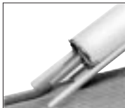
(left) Shown with installed Joist Follower (right) Shown with optional 310-1 Ladder Hook Pull

Model 405-15E — Industrial strength metal carriage • Swivels for ease of application and smooth transitions • Slotted front cap for improved loading and unloading • Includes Albion's Joist Follower for sub-floor applications