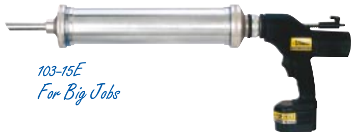
103-15E For Big Jobs

Model 103-15E — Provides 4 times the flow of our 2" bulk models •Mainly used on horizontal surfaces due to its size and weight •Includes our 3/4" dia. Steel nozzle •Barrel size 3 3/8" dia. x 16" long •Recommended for wide joints