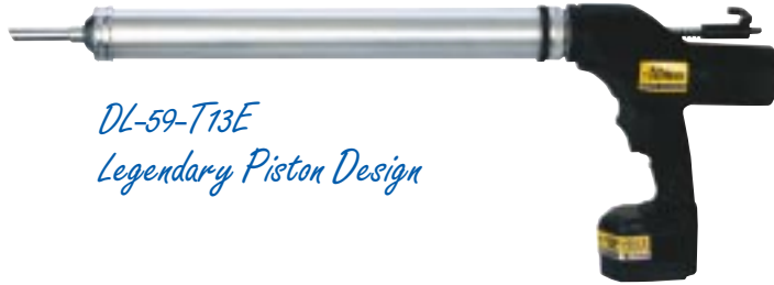
DL-59-T13E Legendary Piston Design

DL-59-T13E — Our most popular bulk model •Includes our 1/2" dia. Steel nozzle •Barrel size 2" dia. x 18" long •Recommended for standard joints up to 5/8" wide •Rolling Extension Kits available for comfortable upright dispensing